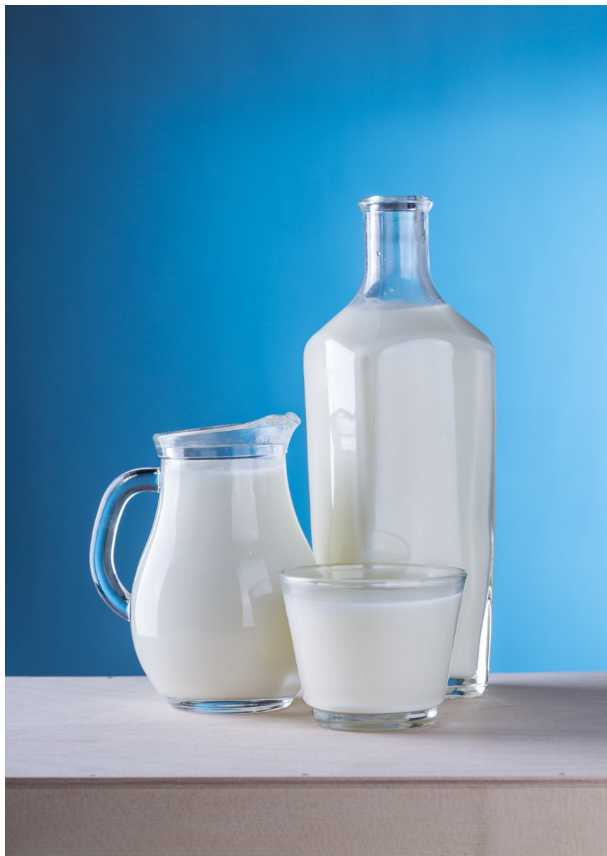
Nice glass of milk! Example of what random unique stuff you can find on Pixabay.