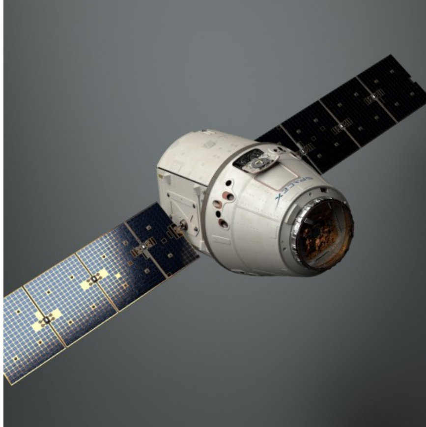
SpaceX Dragon, one of the models you can find on BlendSwap.