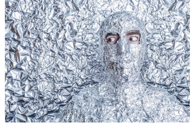
A few of the weird images you can find on Gratisography.